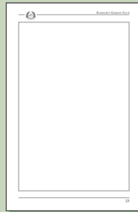
Full Page Ad 4 1/2" x 6 7/8" $200

To stimulate, encourage & further horticultural education, conservation & landscape design through gift scholarships & community projects.