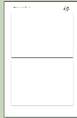
1/2 Page Ad 4 1/2" x 3 5/16" $100