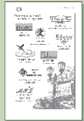
Logo Ad 2 contact lines incl. $25