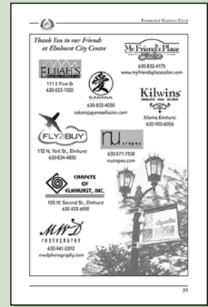
Logo Ad 2 contact lines incl. $30