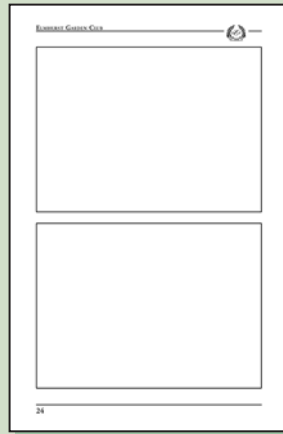
1/2 Page Ad 4 1/2" x 3 5/16" $105