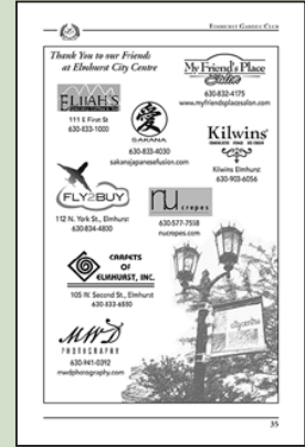
Logo Ad 2 contact lines incl. $30