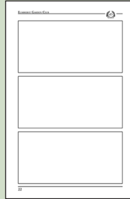
1/3 Page Ad 4 1/2" x 2 1/4" $80