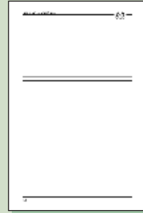
1/3 Page Ad 4 1/2" x 2 1/4" $125